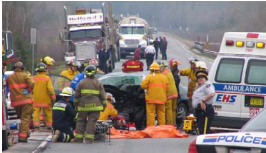
Mass Casualty Disaster Response