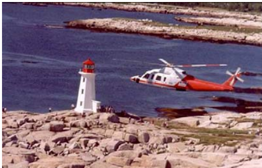
EHS Lifelight Helicopter over Peggy's Cove