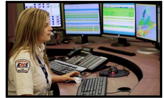
Paramedic Dispatcher at Communications Centre

The department serves as both academic referral centre and community hospital, acting as a trauma centre, stroke centre, burn unit, and providing many specialist and sub-specialist services, like transplant surgery, to patients aged 16 and up from all four of the Atlantic Provinces. The Fellow will further their skills in emergency by working 8 shifts a month as a staff physician in the Emergency Department. Sub-specialty senior residents may arrange clinical responsibilities as well.